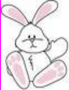
Volume 3 Issue 3

Just two more months of the school year, wow!!! It's almost impossible for me to believe that I will have a sophomore in high school. I realized as I drove past Baylor last weekend that I just have three short years left with him at home. It made me very grateful that I have been able to be a part of his school life all of these years with parties and field trips. Please consider getting more involved next year, we have so many opportunities for you to help. Even the upper school kids like having parents around even if they don't admit it.